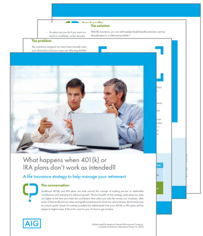
Life Insurance and Retirement Plans Brochure